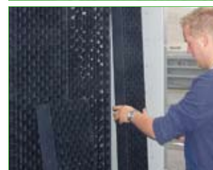
Easily removable combined inlet shields