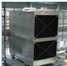
5000 m 2 R&D-test centre