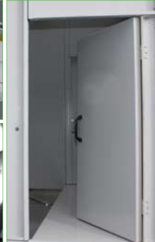
Large access door and internal walkway*