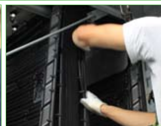
Patented BACross II fill for easy inspection and cleaning