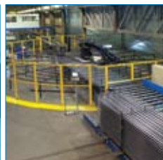
high quality manufacturing