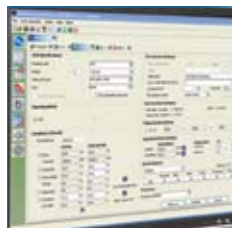
selection and simulation software