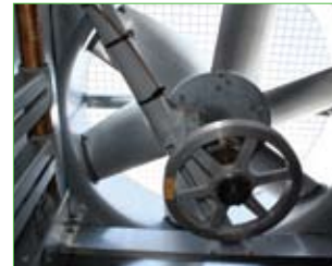
Easily accessible fan drive system with extended lubrication lines*