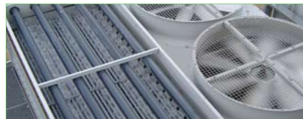
Full access to spray distribution and top of coil during operation

Easy on-site assembly of factory-built sections to reduce shipping and installation costs.