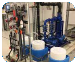
Typical BCP 3 D Installation

measurement and a secondary biocide on a periodic basis. The chemicals are